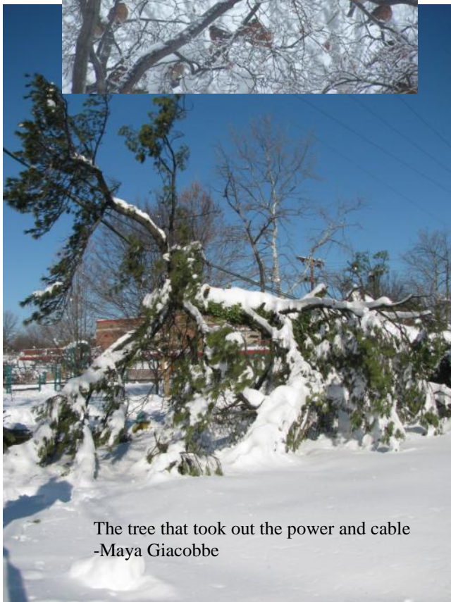
The tree that took out the power and cable -Maya Giacobbe