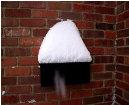
Snow-capped mail box—Karen Tucker