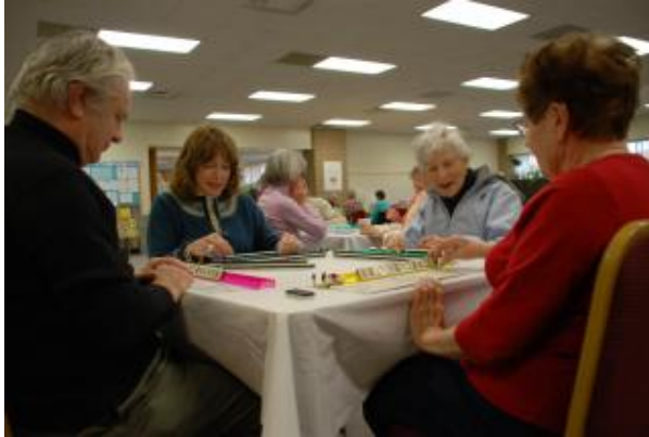
Keeping sharp with Mah Jong at the Aurora Hills Senior Center

Centers at a cost of $5 per senior per day. The nearest center is the Walter Reed Senior Center, located on the far side of the Army Navy Country Club. We think the county can trim $30,760 from the general Senior Program budget without having to close any Senior Centers, and hold true to the principle of equity for all.