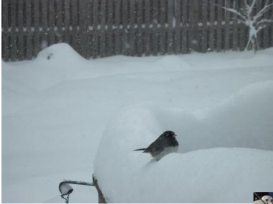
Junco in the white junk - Combs

Photo Essay by Our Citizen Photographers