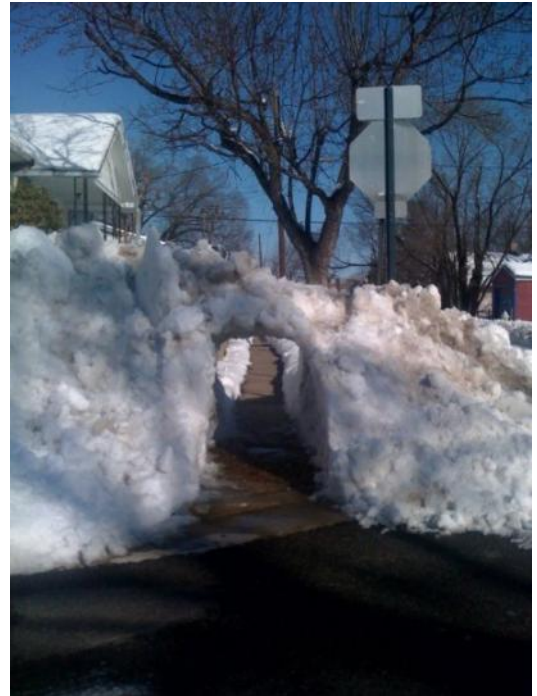
Children's only sidewalk access at 20 th & Hayes